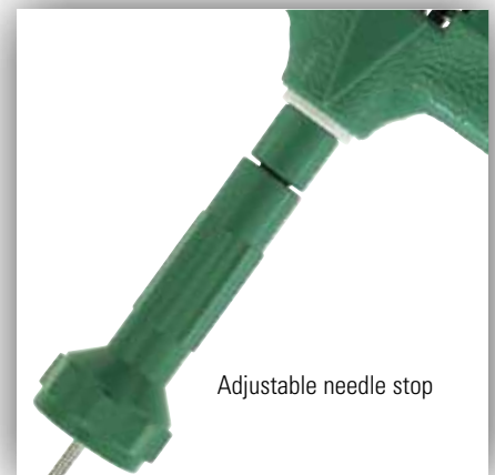
Adjustable needle stop